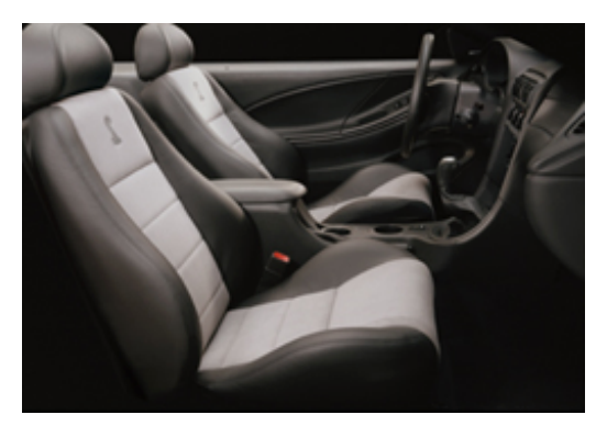
New front bucket seats provide enhanced support. Seating surfaces are Nudo leather with Preferred suede inserts.

New metal-trimmed pedals and dead pedal complete the interior transformation.